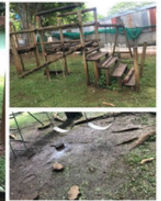
NOW - A Safe Play Area with Fresh